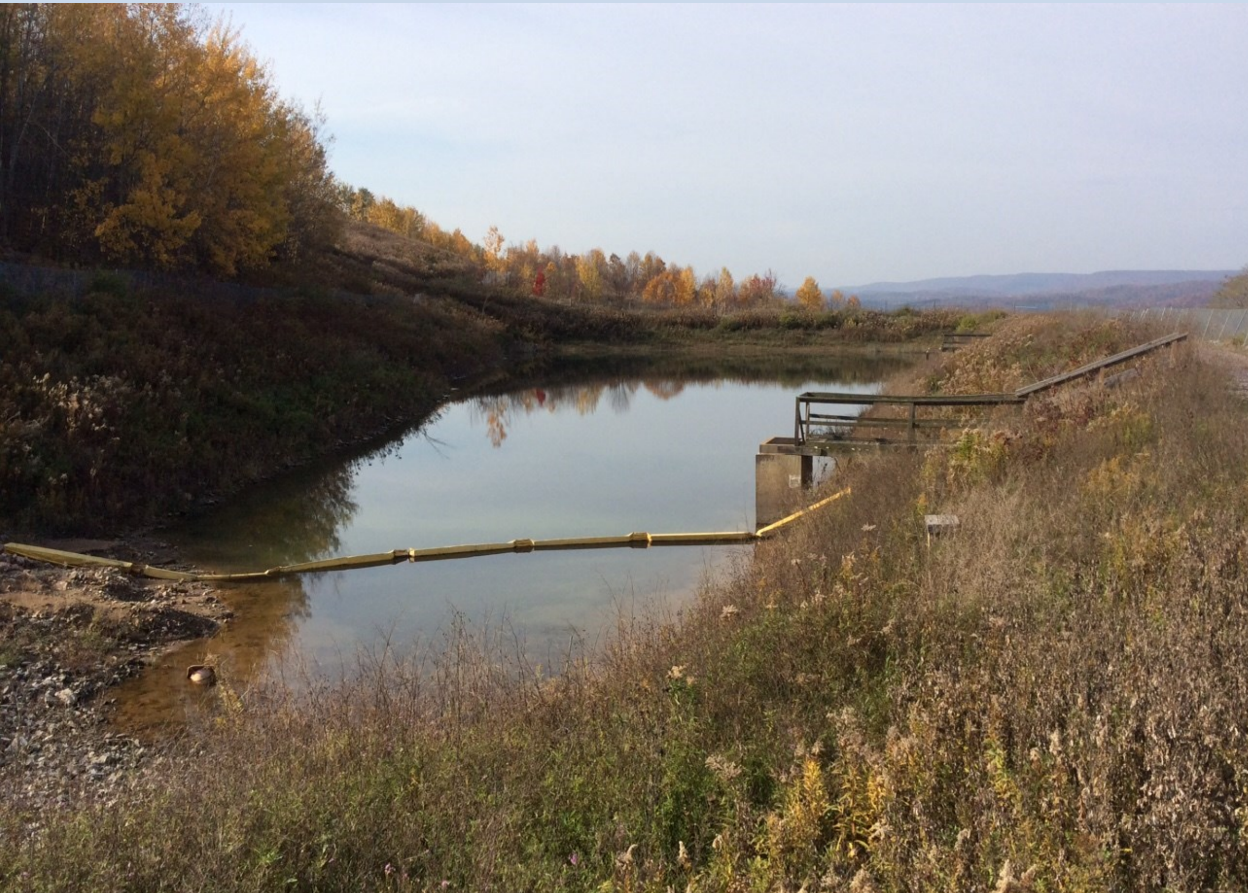
Acid rock remediation from I-99 Project near State College, PA.